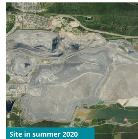
Site in summer 2020