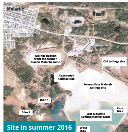
Site in summer 2016