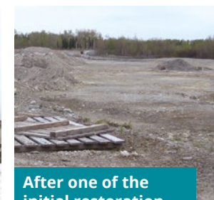
After one of the initial restoration stages